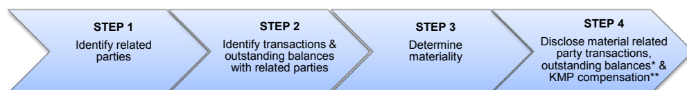
Diagram 1: Applying AASB 124 in 4 steps

Agencies will need to identify those individuals and entities that are related parties and should refer to Australian implementation guidance for NFP public sector entities in AASB 124, which includes practical examples. Treasury has summarised the key principles in the following diagrams.