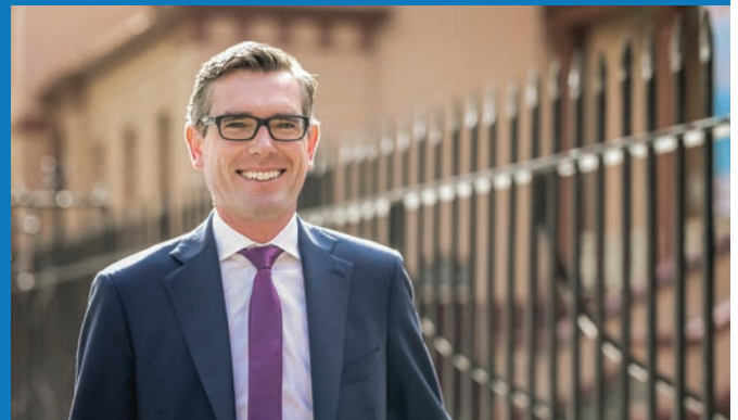
Dominic Perrottet, NSW Treasurer

It's our plan to keep NSW number one, and make our state a better place to live and work for families and communities across NSW.