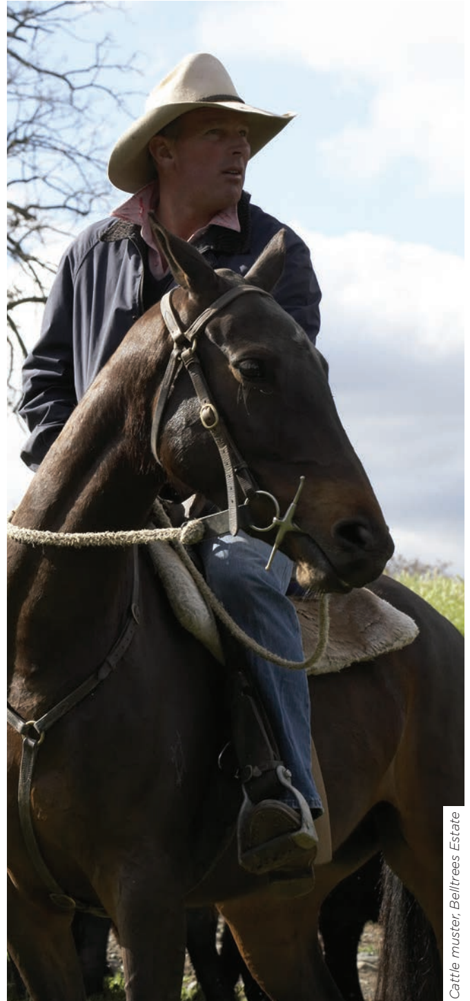
Cattle muster, Belltrees Estate