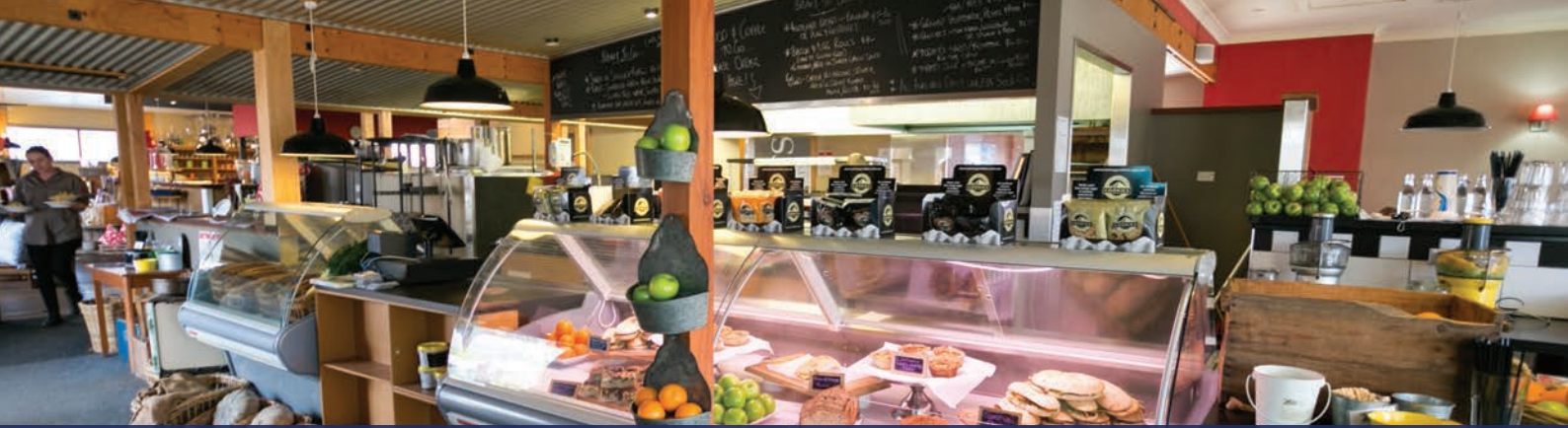
The Lott Foodstore, Cooma