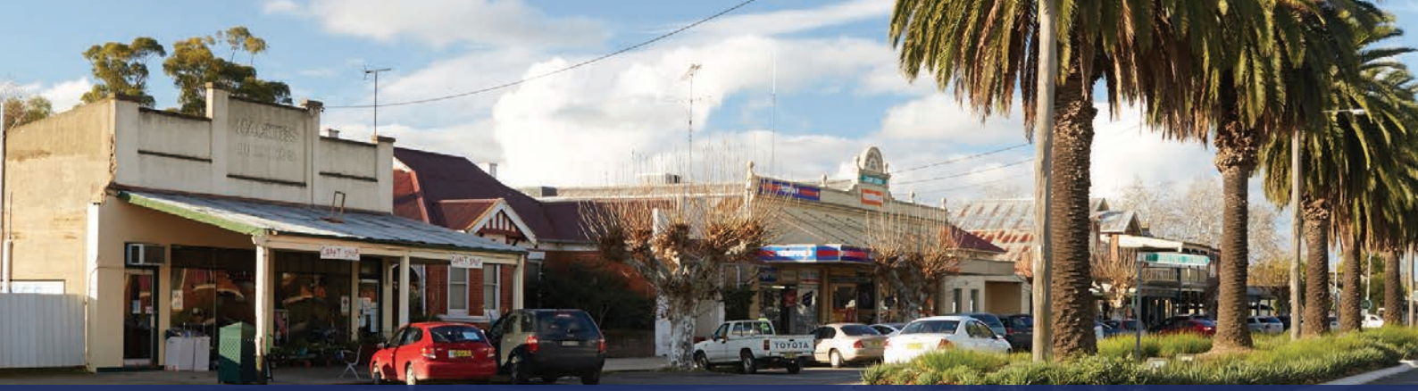
Culcairn main street