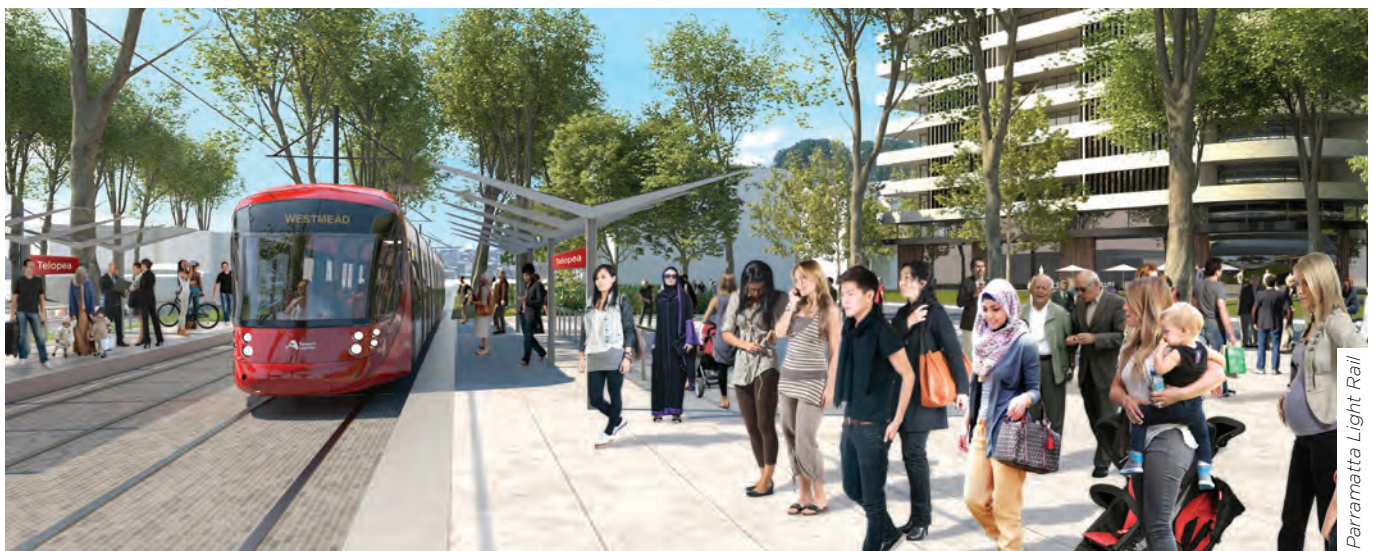
Parramatta Light Rail

The Western Sydney Growth Roads Program and Western Sydney Infrastructure Plan complement other Government initiatives in Western Sydney including planning for Parramatta Light Rail ( $25.0 million ) and for new ferries to support growth in the Parramatta River services ( $10.0 million ).