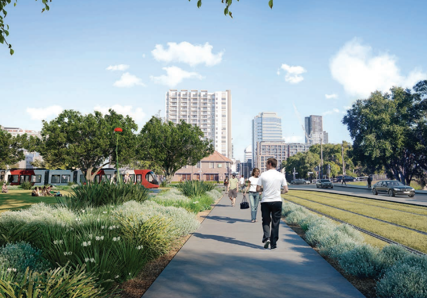
Transport for NSW

The Western Sydney City Deal and the Western Sydney Infrastructure Plan complement other public transport initiatives in Western Sydney, including: