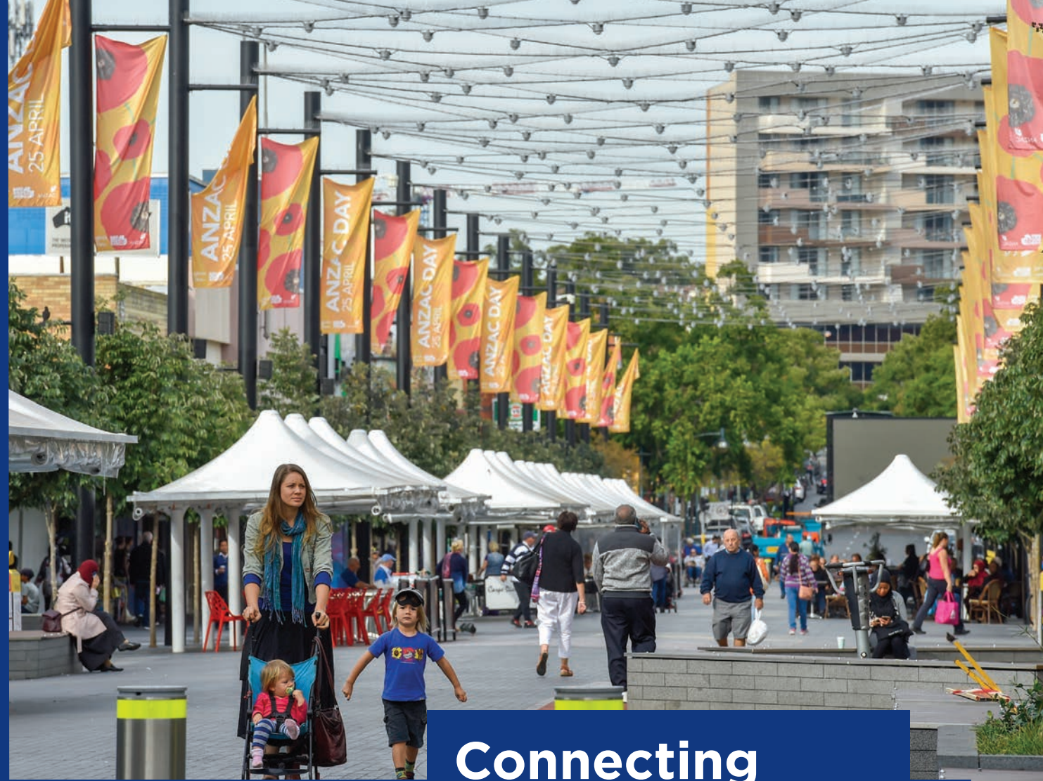
Greater Sydney Commission