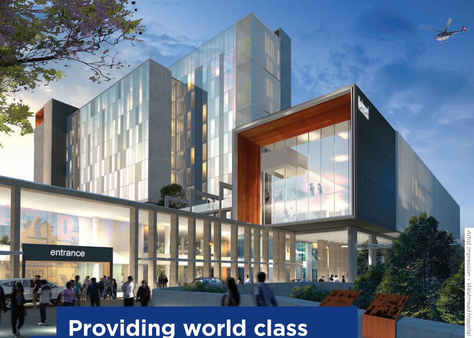
Artist Impression - Westmead Hospital