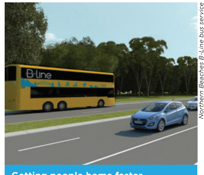
Getting people home faster Northern Beaches B-Line bus service

The NSW Government is taking action to provide faster commutes for more Northern Beaches residents. The new B-Line doubledecker bus service will provide more frequent and reliable public transport for a greater number of people travelling between the Northern Beaches and the Sydney CBD. The plan includes parking for about 900 cars at communities along the Northern Beaches, as well as pedestrian and bicycle links to bus stops as part of an integrated approach to linking people with their destinations. The B-Line service is scheduled to begin operating in late 2017.