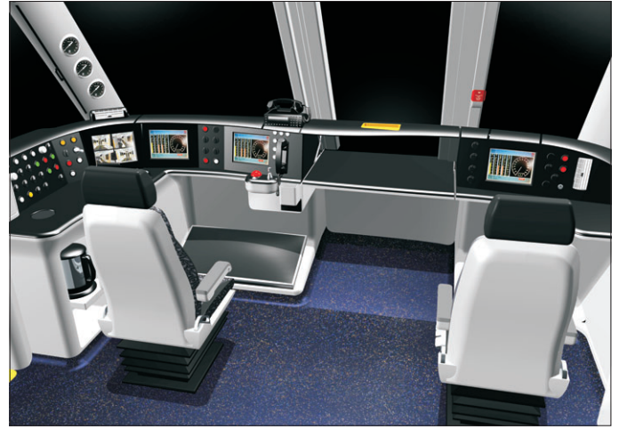
An artist's impressions of the drivers' cab, with a guards' workstation on the right.

financial criteria, one of them the net present cost of the project to RailCorp.