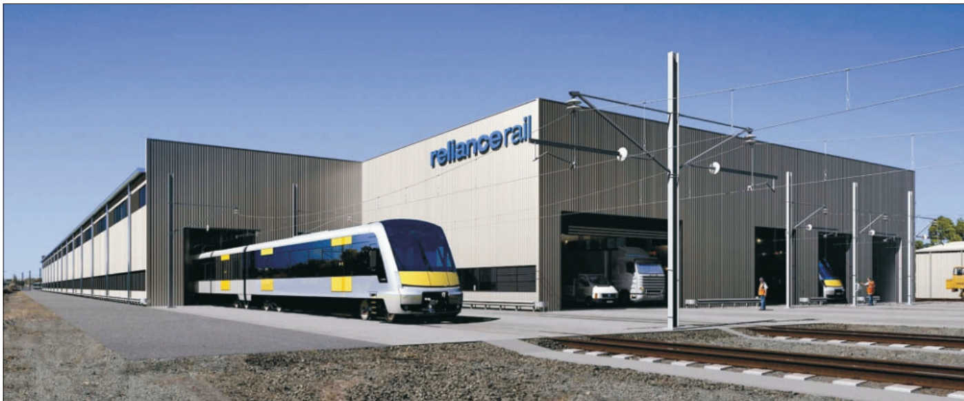
An artist's impression of the new train maintenance facility in Auburn

proposals from the two shortlisted double-deck train proponents.