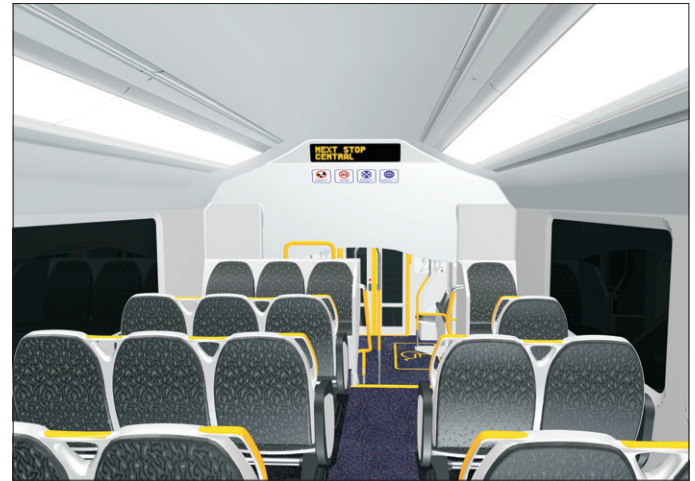
The new trains' design will be a development of the Millennium train design.

The private sector participants in the project include: